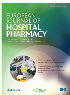
Pharmacist's assistant preparing parenteral nutrition. Limoges hospital, France.