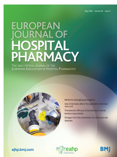
Pharmacist's assistant preparing parenteral nutrition. Limoges hospital, France.