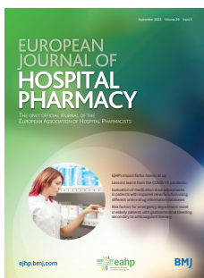
Hospital pharmacist in a storage facility making an inspection.