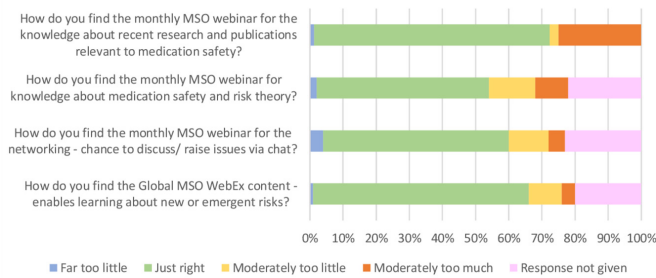
Figure 2 Survey respondents' opinions on the MSO webinars outlining content and knowledge acquired. MSO, medication safety officer.