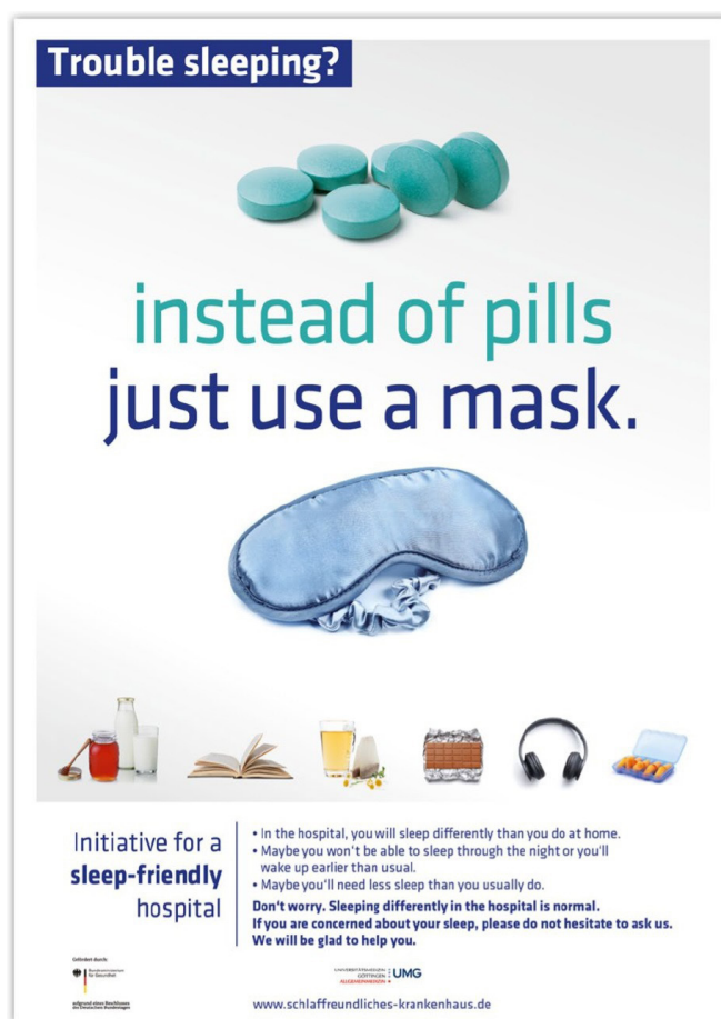
Figure 1 Example of a poster highlighting alternatives to sleep-inducing drugs, which hung on every hospital ward (translation SH).

Reviews showed that formal didactic conferences and passive forms of medical education such as brochures or printed clinical guidelines are the least effective methods for changing physician behaviour. 19 Moreover, stakeholder engagement is essential for moving knowledge into action within healthcare. 20 This is the heart of the MRC framework and the guiding principle for the Sleep-friendly Hospital Initiative.