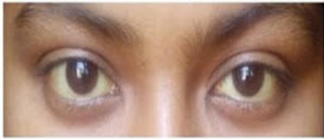
Figure 1 Yellowish discoloration of eyes 8 days after vaccination.

relatives who had received the same vaccine (both doses) had no reaction to it.