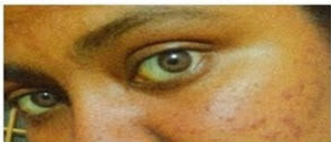
Figure 2 Yellowish discoloration of eyes 10 days after vaccination.

The patient was prescribed ursodeoxycholic acid (300 mg two times per day) and pantoprazole (40 mg two times per day). In the second week, she was prescribed S-adenosyl-L-methionine (400 mg two times per day), N-acetylcysteine (600 mg two times per day) and vitamin K 4 10 mg (one time per day for 3 days). In the third week, she was given prednisolone 40 mg one time per day.