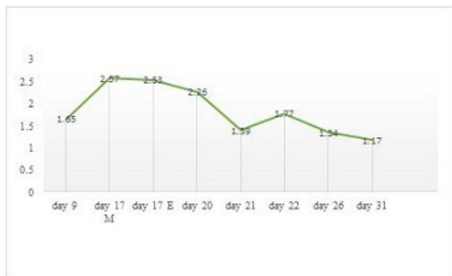
Figure 5 Improvement of prothrombin time test/international normalized ratio (PT/INR) during treatment.

Although the patient's condition improved after the use of the drugs, her dermatological problems subsided only after stopping steroid therapy. She had altered blood sugar levels and insomnia during the therapy period.